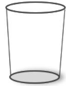
Cup (from home) to hold tube upright